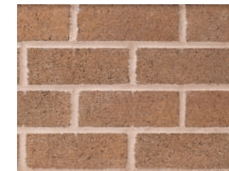
Rustic Buff Range