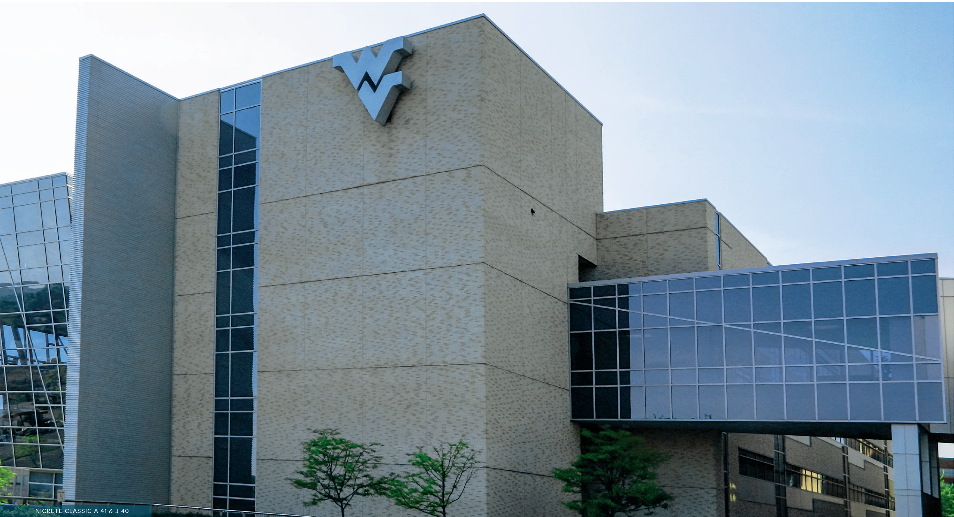
NICRETE CLASSIC A-41 & J-40