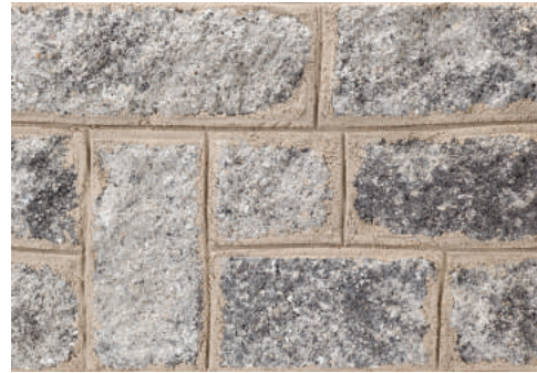
Limestone Gray Blend