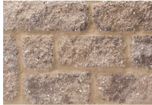
Fieldstone Buff Blend