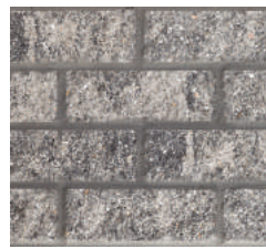
J-90 Limestone Blend