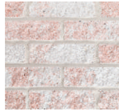
A-75 Pink Mist