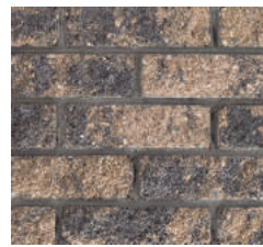
NM-130 Sandstone Blend