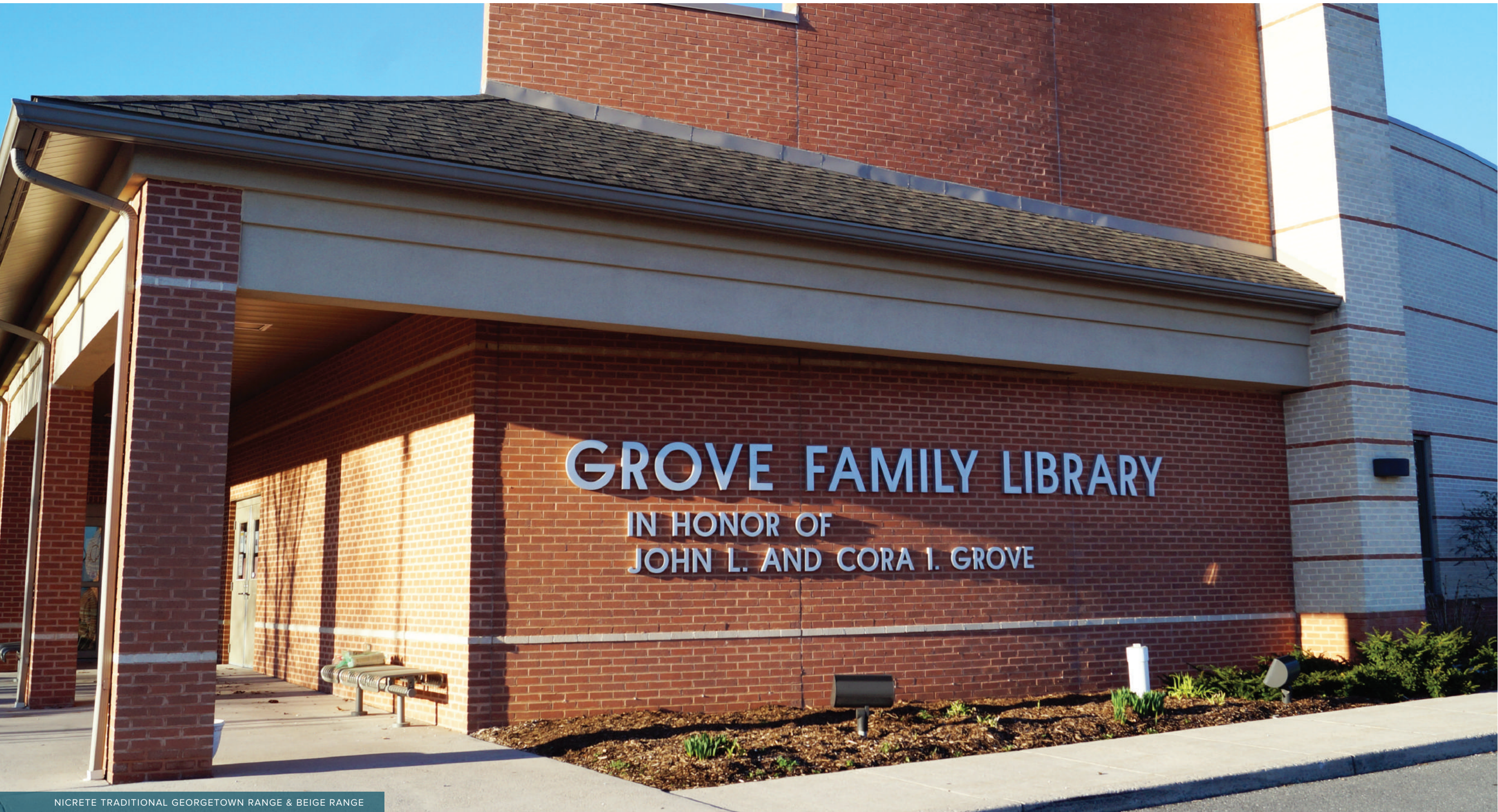
NICRETE TRADITIONAL GEORGETOWN RANGE & BEIGE RANGE