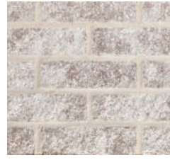
A-68 Mocha Mist