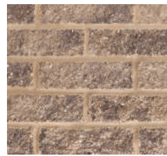
J-91 Earthen Blend