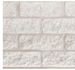
A-13 Snow White