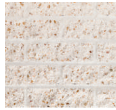
A-18 Caramel Chip