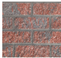
J-92 Rustic Blend