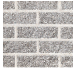
J-12 Dove Grey