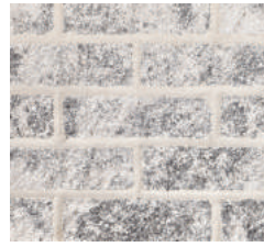
A-71 Glacier Blend