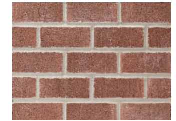
Chambers Rose Range